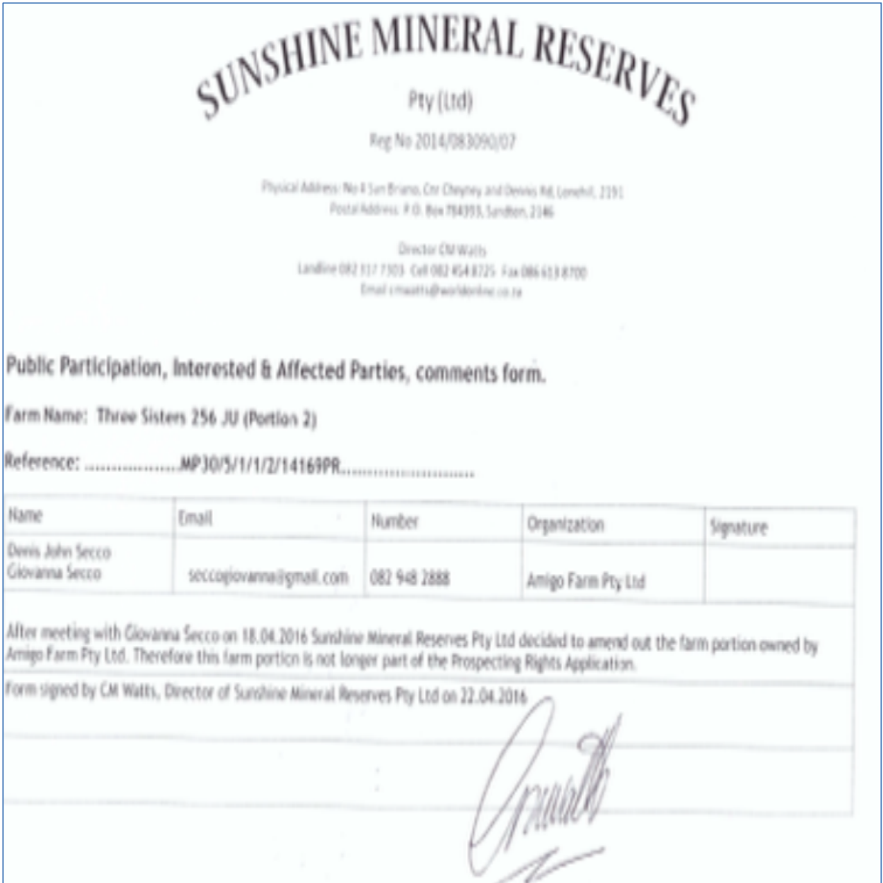
Figure 2- Sunshine Mineral Reserves (Pty) Ltd response to Amigo farm